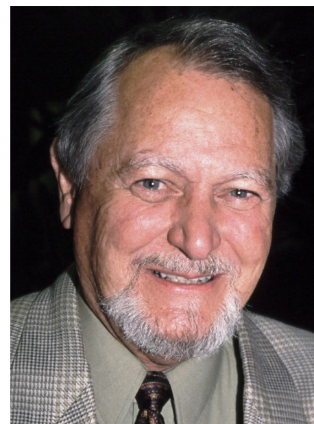
Clive Cussler, Author

Any book by Clive Cussler" is the RW-C Book Group's December selection – each of us will read one of his books and then tell the group about it! We'll meet Monday, December 30, at 10:30 a.m. in the Rappahannock Room (note that this is a fifth Monday ).